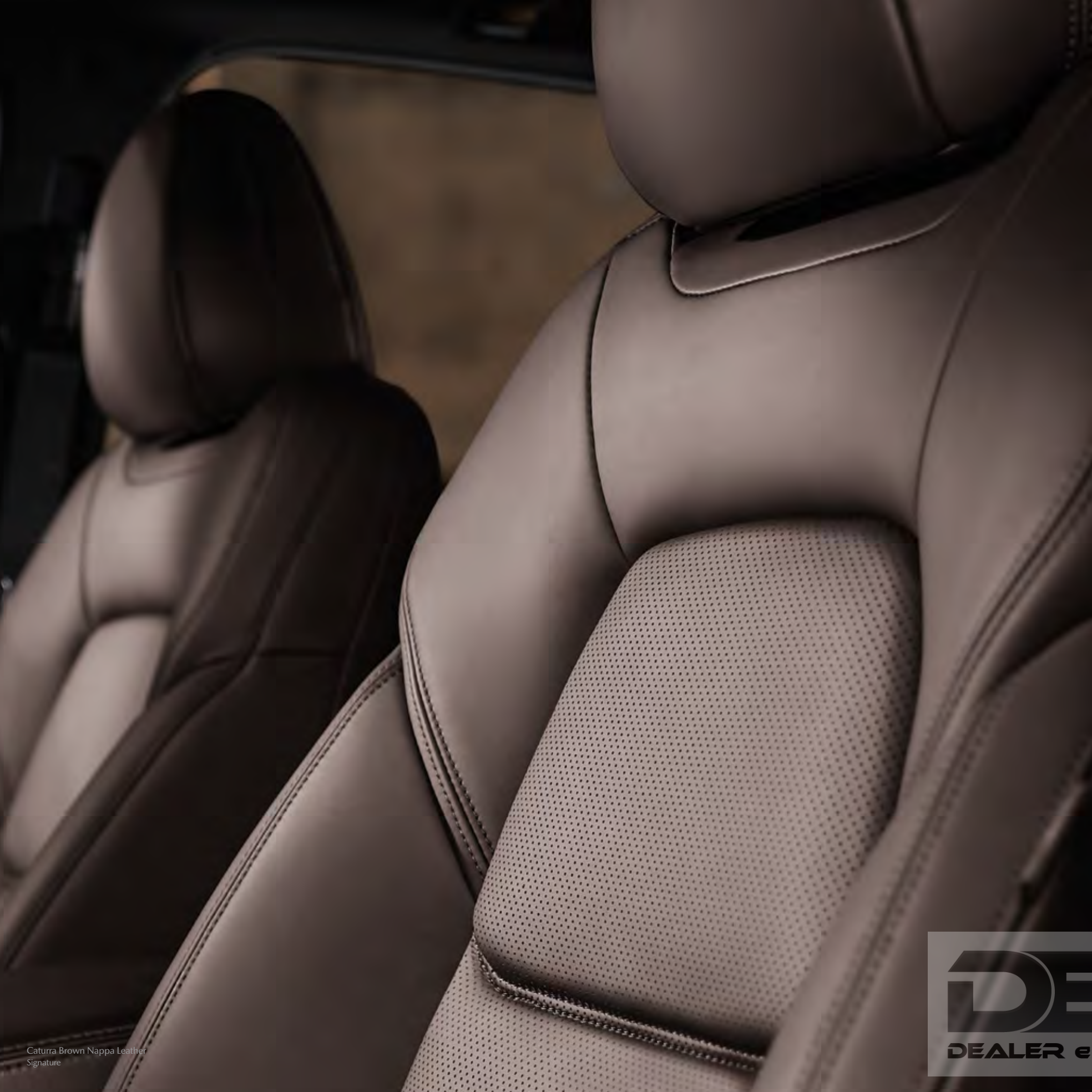
Caturra Brown Nappa Leather Signature