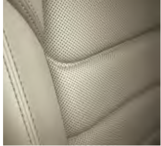
Parchment Leather Grand Touring and Grand Touring Reserve