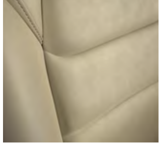
Silk Beige Leatherette/Lux Suede® inserts Touring