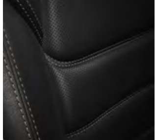
Black Leather Grand Touring and Grand Touring Reserve

Upholstery plays a unique role in automotive design. It is the one element that makes direct contact with the driver and passengers throughout the entire drive. Every inch of our carefully constructed upholstery elevates your journey in both beauty and comfort. Expert fabricators experiment with textures, stitching and seam placements to create a range of distinct and expressive designs. So you can enjoy an elegant level of refinement in every Mazda CX-5. It's one more way we consider you in every aspect of your drive.