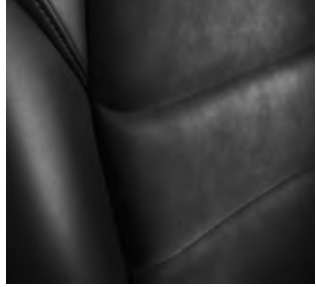
Black Leatherette/Lux Suede® inserts Touring